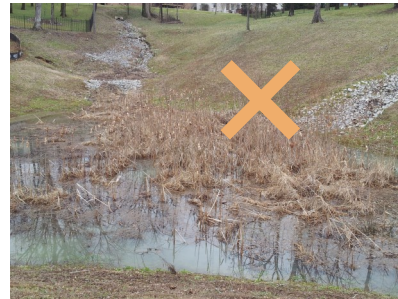
Overgrown and holding water longer than 72 hours