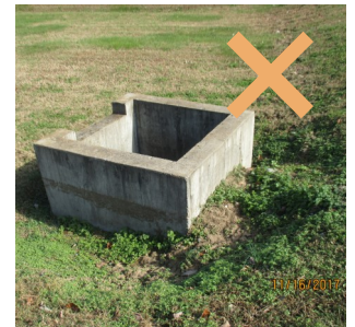
Safety Issue—Missing grate!