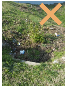
Trash, sediment, and vegetation blocking inlet