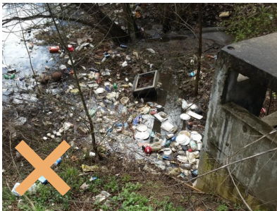
Trash around outlet structure