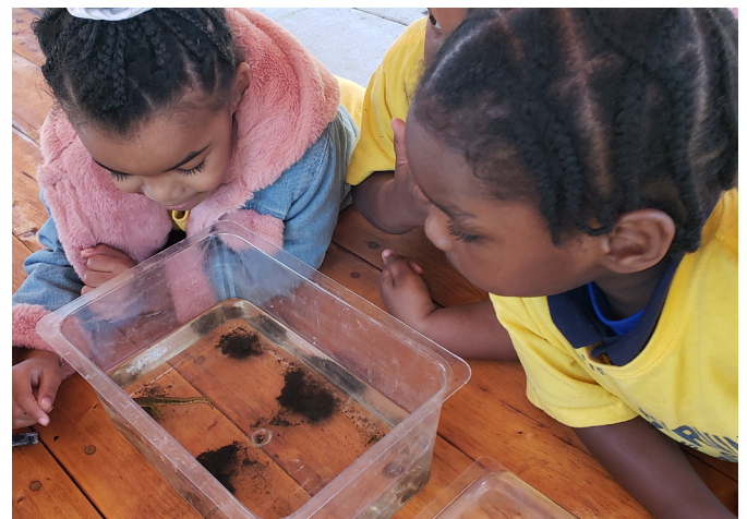
Elementary students observe and ask questions about organisms discovered in the pond during a naturalist-led field trip

I found both trips very enjoyable and informative! It was great to be so hands-on and I enjoyed that it's aligned with our curriculum. It was super fun and engaging! - NSA student after attending the Water Quality and Ecosystem field labs