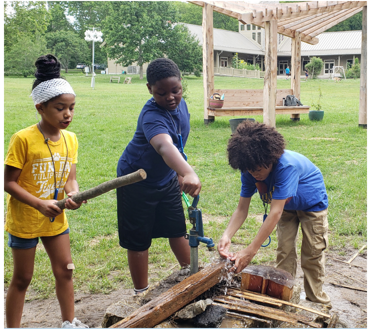
Youth being creative with the Nature Play water features and loose natural objects

Trails near the campus were re-routed and bridges were added as part of a park-wide trail restoration initiative.