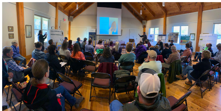
Participants listen to research presentations during the annual IBBA conference held at Warner Park Nature Center this fall