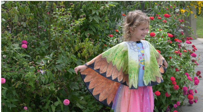
A young visitor zips around the garden like a hummingbird during the Hummingbird Celebration

In total, more than 3,000 visitors attended our special events in 2023.