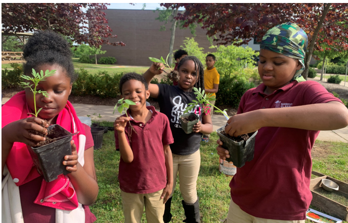
Youth from Madison Park hold seedling plants that they will transplant into pots during their Nature Detectives gardening program.

We planted flowers and salsa vegetables in pots at 10 community centers in May! Community Center staff and youth in summer and after-school programs tended to the gardens all summer long and snacked on tomatoes, peppers, and basil.