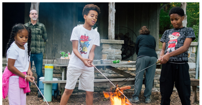
Youth roast hot-dogs over the campfire during a Fall PEN Pals Campfire & Night Hike program.

12 community centers served by Nature Detectives