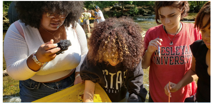
AP Environmental Students collect macro-invertebrates as part of a Water Quality field lab

Offered seven week-long sessions of summer Naturalist Camps led by seasonal staff, providing 109 campers with 2,738 hours exploring nature. See Summer 2023 Report for more details.