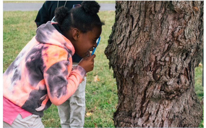
A young participant practices using a magnifying glass as she peers into a tree cavity during an after-school nature exploration.

Our partners at Nissan generously donated a van to the Nature Discovery Program in the spring. The van allowed us to expand field trips to Beaman Park over the summer and to transport youth to Warner Parks for outdoor adventures.