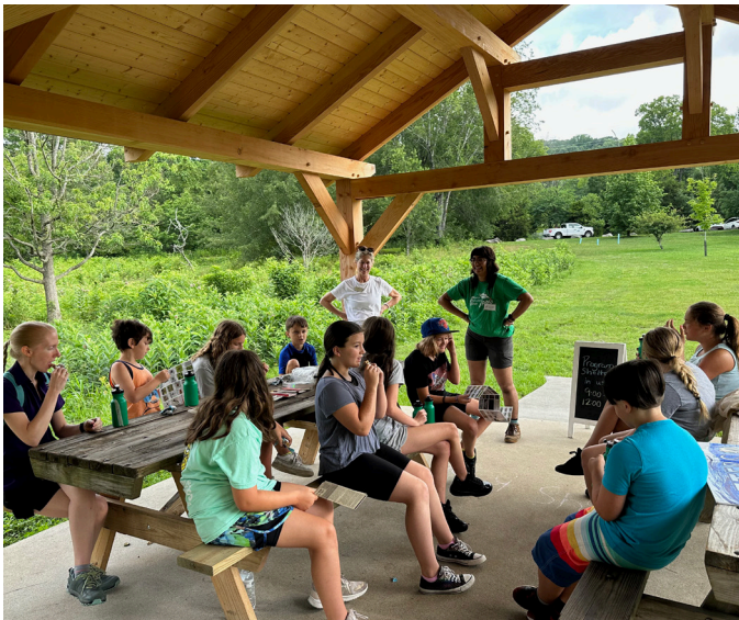
Campers enjoying a snack in the new Nature Play shelter

A new Nature Play pavilion was constructed adjacent to the Nature Play area (project funded by FOWP) and it has quickly become the favorite place for family picnics and gatherings.