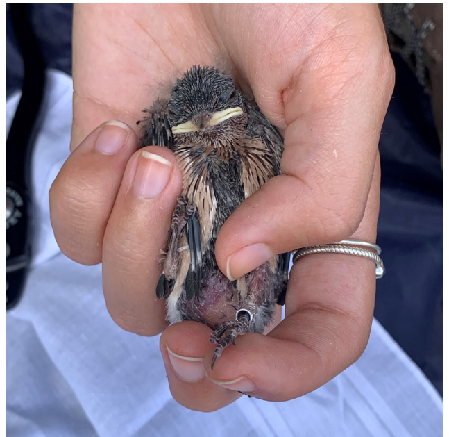
A recently banded Barn Swallow at Steeplechase. These nests, monitored by Lipscomb interns, had a success rate of 69% in 2023

43 thrushes and purple martins were radio-tagged this year. A male Wood Thrush first radio-tagged by us in 2021 returned in 2022 and was detected again in 2023. And during fall migration, one of our Swainson's Thrush was detected in Mexico and a Purple Martin was detected in Costa Rica.