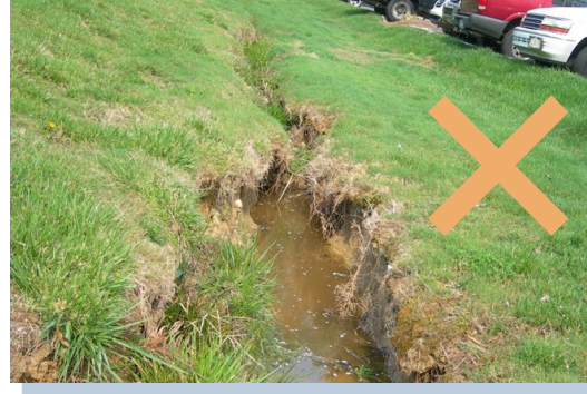
erosion due to improper maintenance