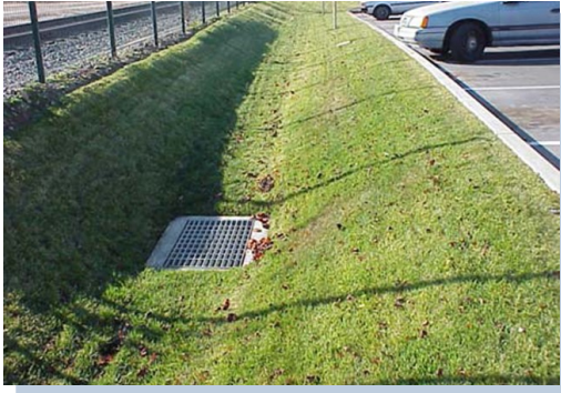
properly maintained and functional

Grass swales are open channels that are designed to convey stormwater runoff through a natural, vegetative filter. These swales provide more runoff filtration and volume reduction compared to the traditional system of curbs and gutters with storm drain inlets and pipes.