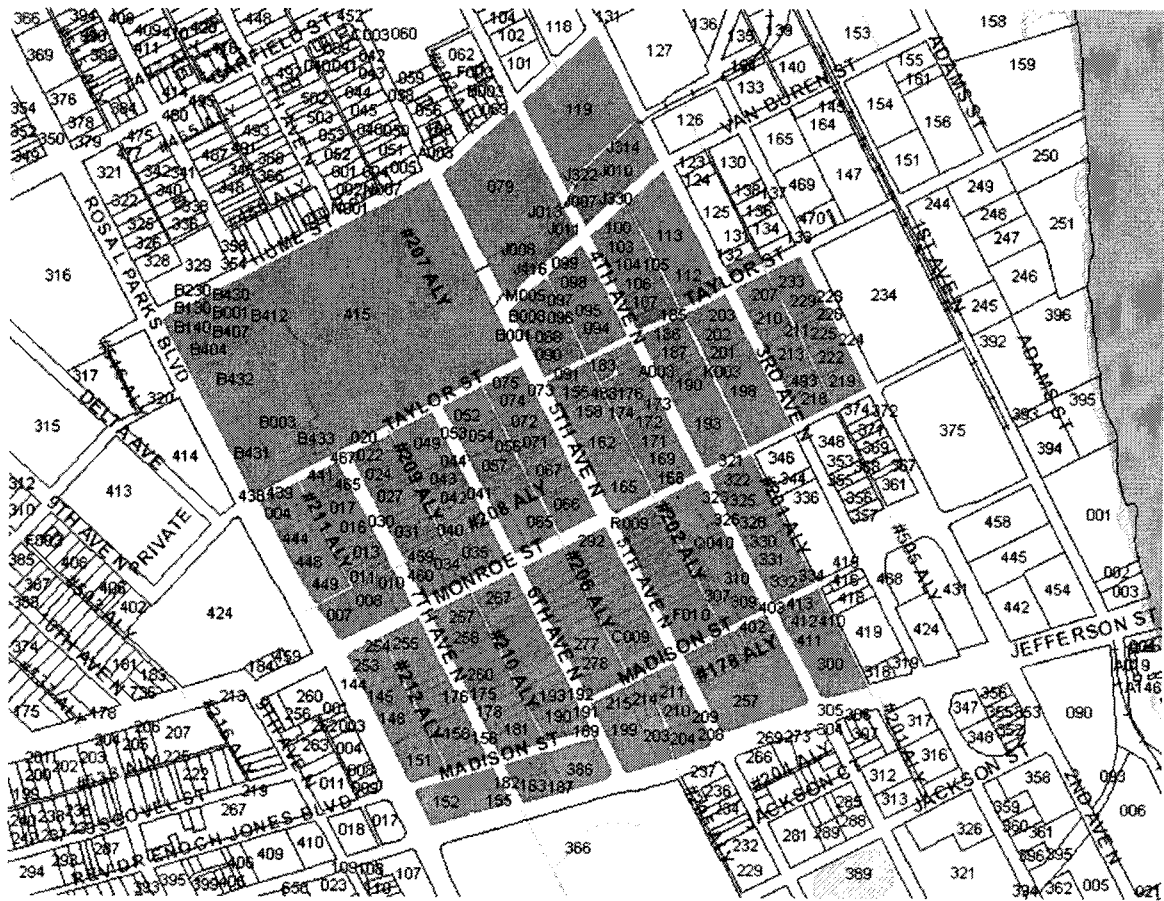
2007Z-167U-08 Germantown Historic District Map Various, Parcels Various Subarea 8 (2002) Council District 19 - Erica S. Gilmore