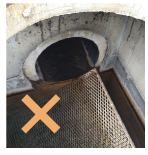
Trash screen displaced