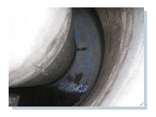
properly maintained and functional

Water quality units are premanufactured units that are designed to filter out pollutants before discharging stormwater to the downstream drainage system. The structures require frequent maintenance as they are, by design, limited on volume of pollutant storage.