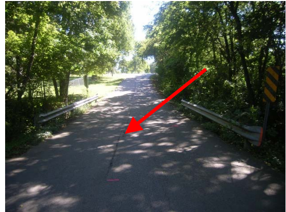
Pavement Cracking & Settlement