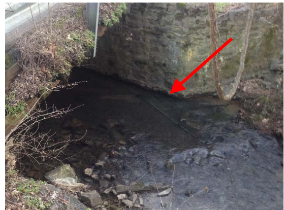
Scour Under Abutment Wall