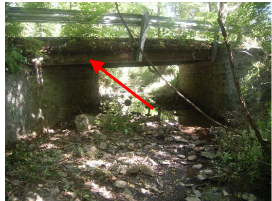
Section Loss along Steel Girders