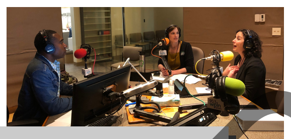
This is Nashville - WPLN