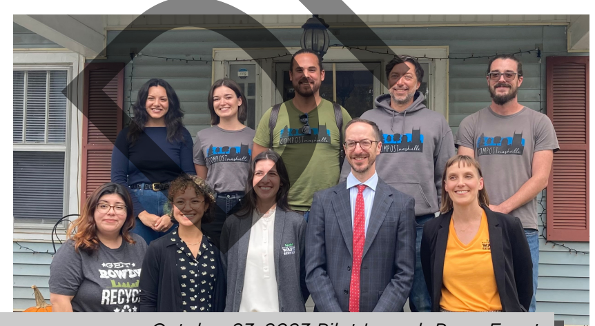
October 23, 2023 Pilot Launch Press Event

Nashville's Food Scraps Pickup pilot program has been touted by numerous entities including the National Resources Defense Council, Urban Green Lab, the Environmental Law Institute, and the Metro Nashville Mayor's Office. This program is showing the potential for food waste diversion from Nashville residents and has been widely welcomed by participants and non-participating residents. With over 2600 applications for a 750 household program, we have been able to create a pilot that reflects Nashville's diverse community members and collects invaluable data to inform future planning.