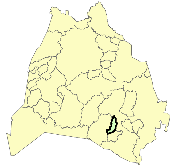
Figure C.8 Mill Creek - Sorghum Branch Damage Reach Map