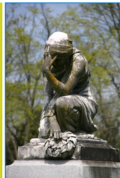
Mt. Olivet Cemetery

DO NOT allow children to climb, sit or lean on monuments since many monuments are unstable and could cause serious injury.