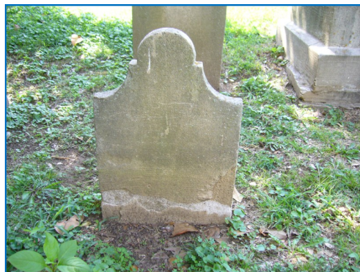
The decay of the carved garland to the left may have been caused by chemicals, detergents or acid rain. The damage at the bottom of the stone to the right was likely caused by weed eaters or mowers.