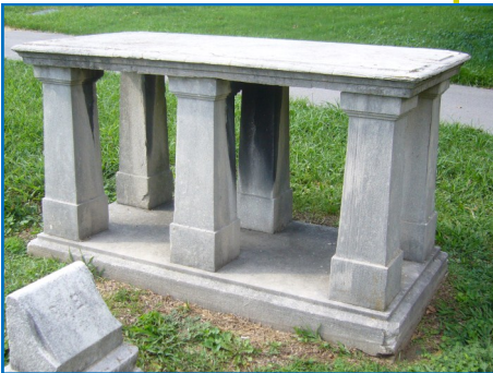
Table tomb: Ledger set on 4 to 6 feet. This monument looks similar to a box tomb but with four to six legs rather than enclosed sides. (Images from Nashville City Cemetery. (Image from Nashville City Cemetery.)

Pulpit Markers: Height is usually less than 30". The monument has an inscription on top or side and will typically have a book (bible) or scroll on top. Often there will be an inscription in the book.