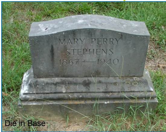
Die in Base

Die-in-Socket: With a Die-in-Socket the tablet has a tab that fits into a socket in the base. The image on the right shows a base missing the tablet allowing a view of the socket.