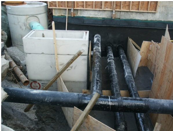
Service lines entering building on Molloy Street