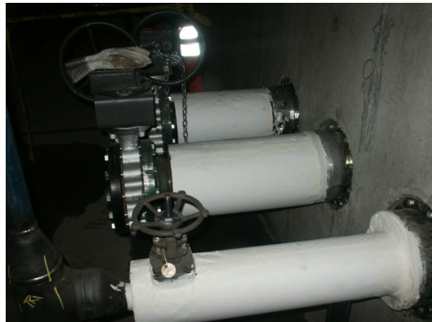
Service lines stubbed out in parking garage