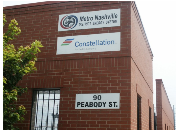
Installed new signs on building which included the new Constellation Logo