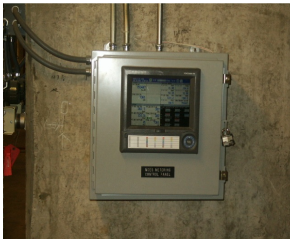
MCCC Cx Panel

C-Tech checked out the steam metering during the startup on July 24, 2012 and found a bad valve actuator on the main steam line. This was removed and sent back to the factory. A replacement actuator was installed in August 2012.