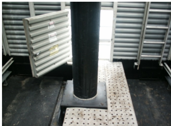
Re-coated the basins and riser pipes in Cooling Towers 1, 6, 9 and 14