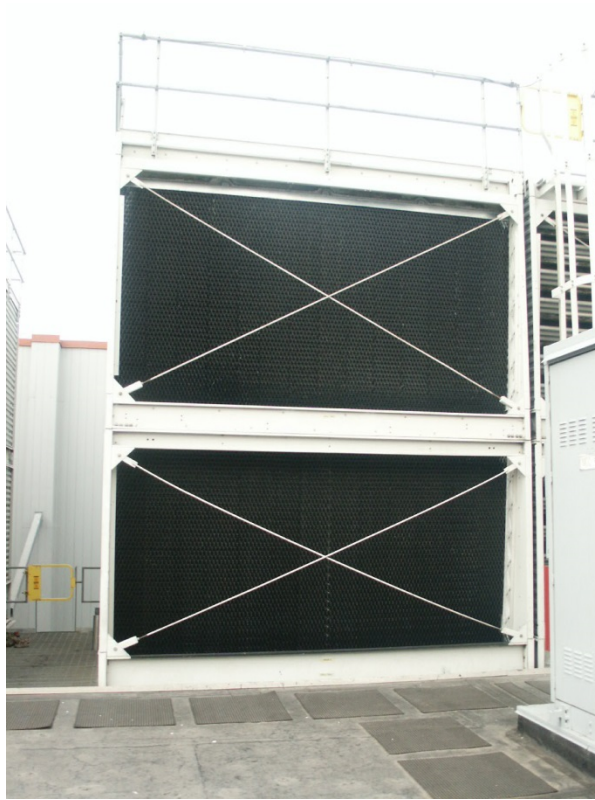
Installed new fill in Cooling Towers 1, 6, 9 and 14

The following improvements were performed in and around the generation facility: