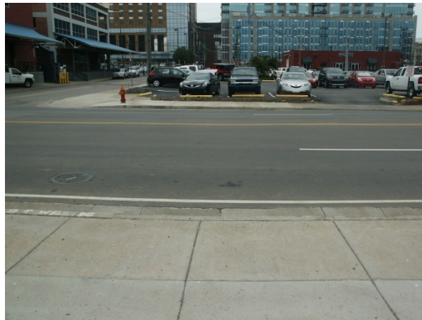
Final paving on First Avenue

DES-094 Exploratory Excavation & Repairs on Molloy Street Due to an Independence Day celebration, the paving for this project had to be delayed into FY12-13. The final paving across First Avenue was completed August 10, 2012. All backup documentation was delivered to TEG for review and was approved in October 2012.