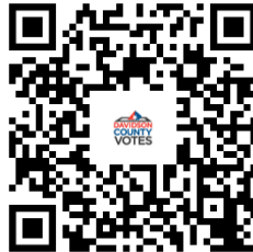
How to use the new Voting Machines