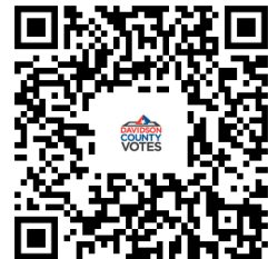
Where do I vote on Election Day?