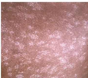
Picture: Rash due to secondary syphilis.

1,509 patients made 1,637 visits, receiving an average of 3.6 (median of 2.0) services per visit in the STD Clinic. There were 5,933 procedures for these clients. We diagnosed 50 chlamydia cases, 31 gonorrhea cases, and 4 syphilis* cases (1 primary & secondary, 1 early latent, 2 latent & late latent).