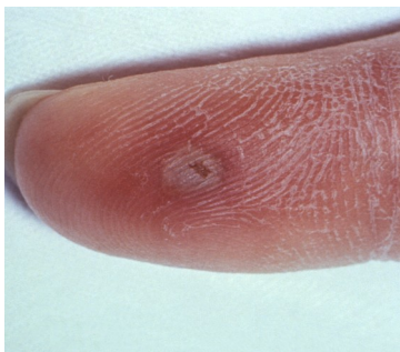
Picture: Skin lesion due to secondary gonorrhea.

* Not including congenital and neurosyphilis cases.