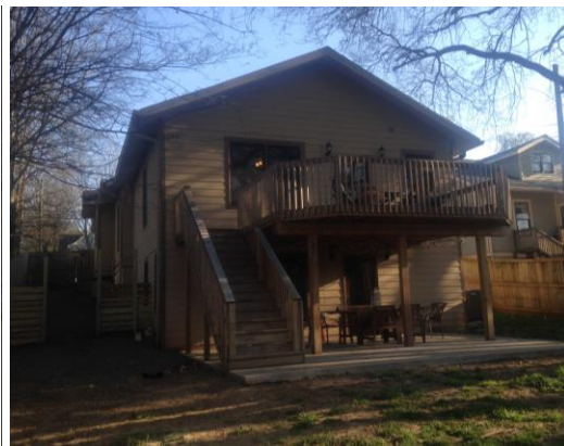
Figures 1 and 2 show the front and rear of 1622 Fatherland Street.