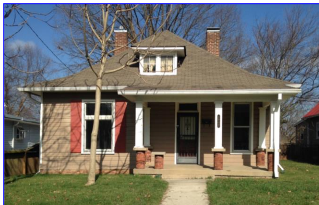
Figure 1. 1909 Russell Street.

Background: 1909 Russell Street is a c. 1920 folk Victorian house that contributes to the historic character of the Lockeland Springs-East End Neighborhood Conservation Zoning Overlay (Figure 1). In February 2017, MHZC staff issued an administrative permit for a rear addition to the house.