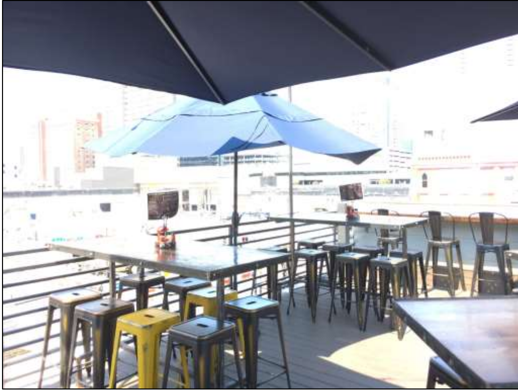
Rooftop area 423 Broadway