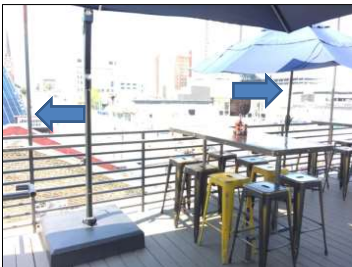
Figure 3. Metal poles visible attached to railing