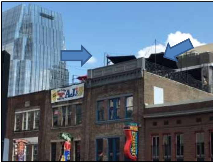
Figure 2. 423 Broadway

Violations – New Construction, Illumination: The rooftop addition was initially constructed as approved, with its front wall set back more than thirty feet (30’) from the front wall of the building, in accordance with the district design guidelines. Recently the business installed poles for string lighting. (See figures 1 -3.) New construction should step back from the front wall at least thirty feet (30’) to ensure that new construction is not “visually jarring or contrasting” and that it is “minimal” compared to the historic building. Permanently-installed features forward of the thirty foot (30’) set back do not meet the design guidelines. The project does not meet section H of the design guidelines for additions.