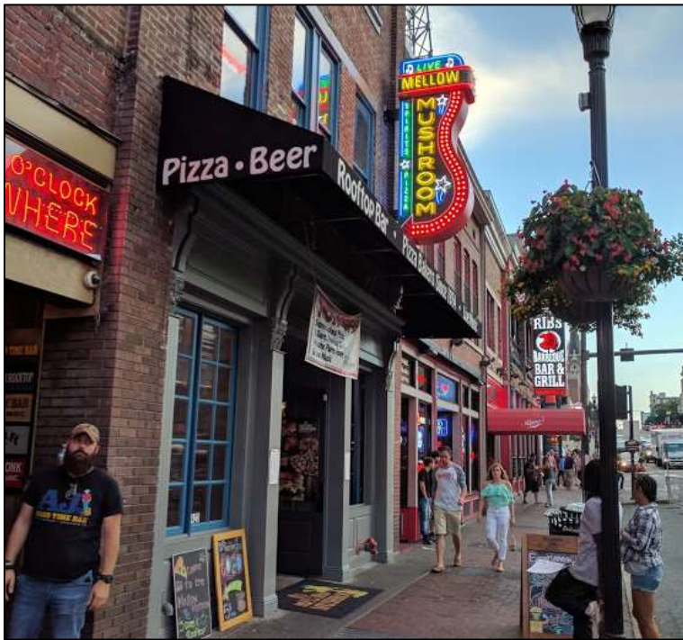
Figure 4. Unpermitted awning signage

Signage: The MHZC approved projecting signage in December 2016. Unpermitted signage has been added to the awning (See figure 4). The building is allotted forty-six square feet (46 sq. ft.) for signage. The approved projecting sign is forty-four square feet (44 sq. ft.), leaving two square feet (2 sq. ft.) remaining for signage. The estimated area of the awning signage is an additional twenty-eight square feet (28 sq. ft.). Therefore the building is over its allocation of sign area by an estimated twenty-six square feet (26 sq. ft.). Section IV also limits the width of text and graphics to seventy-five percent (75%) of the width of the awning; the text on the front takes up approximately ninety percent (90%) of the width of the sign. The signage does not meet section IV of the guidelines for signage.