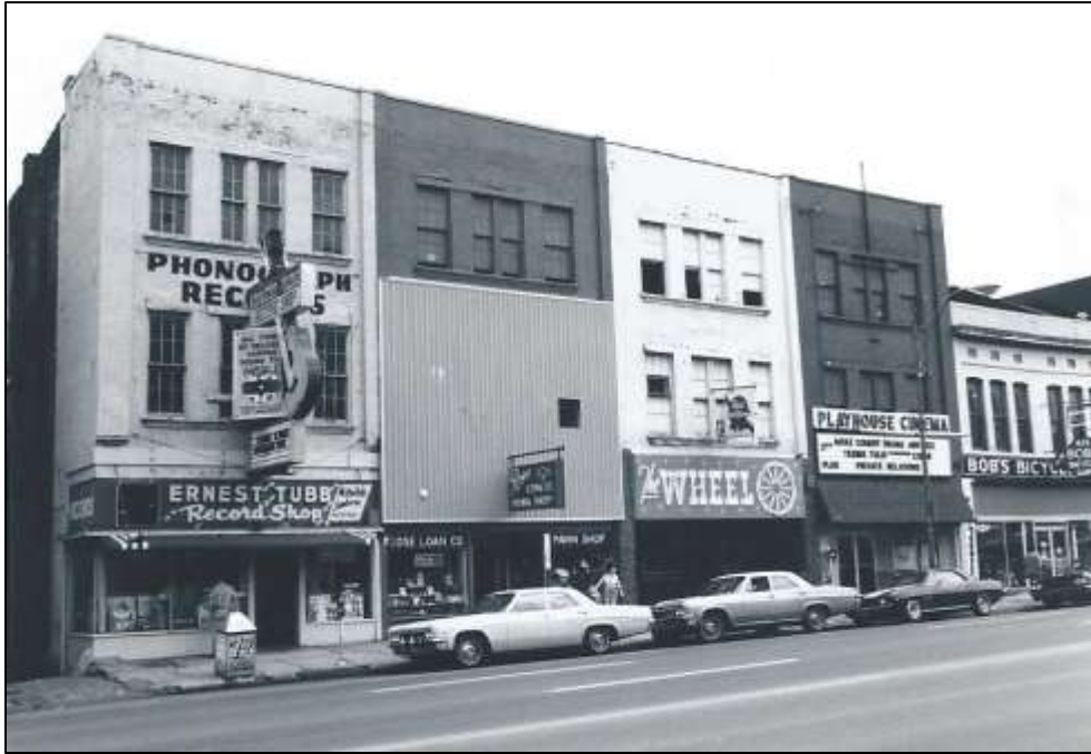
417-423 Broadway, circa 1971