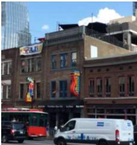
Figure 1: 423 Broadway

Background: 421 Broadway is listed in the Broadway National Register nomination as a c.1880 Victorian commercial building. In 2016 MHZC Staff approved rooftop addition, rear addition, projecting signage and alterations to the storefront.