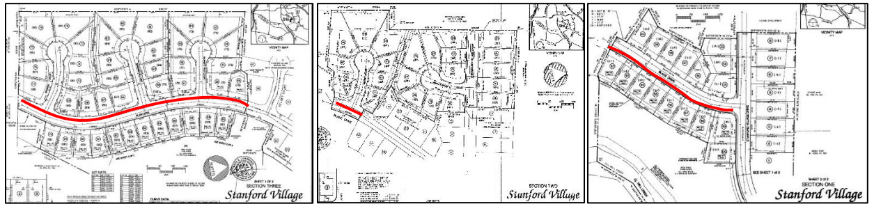
Figure 1: Stanford Village, Sections Three to One (l to r).

The original portion of Blake Drive was developed in three segments, running from north to south. The first portion of Blake Drive appears on the 2000 plat for Stanford Village, Section One, a second portion appears on the 2001 plat for Stanford Village, Section Two, and a third portion appears on the 2001 plat for Stanford Village, Section Three (Figure 1).<sup>1</sup>