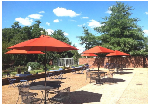
Centennial Art Center courtyard

Through a long-standing partnership, the Herb Society of Nashville maintains a beautiful herb garden in our courtyard making this a wonderful place to visit or have lunch in Centennial Park. Monday through Thursday from 9:00 a.m. - 5:00 p.m. the enclosed courtyard behind CAC is open to the public. The courtyard can be rented for private events such as outdoor weddings.