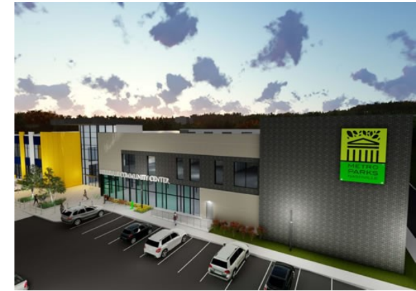
Bellevue Regional Community Center