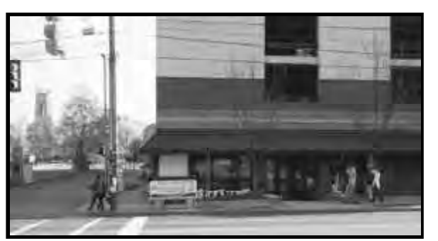
Although the upper floor design of this garage is inappropriate for the Village, awnings, street trees, and retail space on the ground floor maintains the vibrance of the street level.