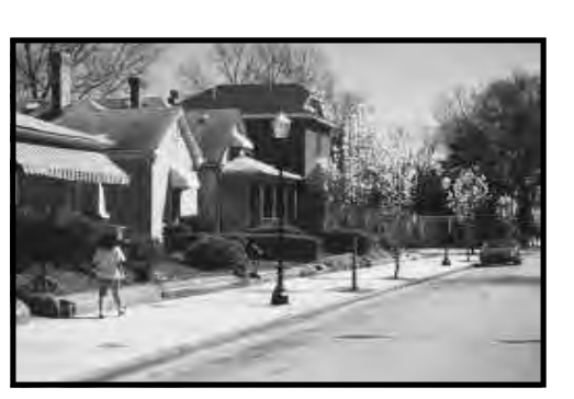
In Sub-districts 2A and 2B, pedestrian-scale lighting could add character to the streetscape and serve as a safety feature.