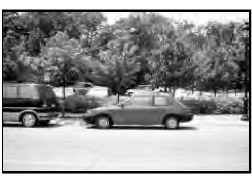
Extensive landscaping softens the appearance of this lot and minimizes direct views of parked cars from the street (foreground).