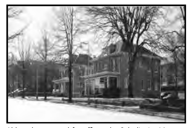
Although now used for offices, the Sub-district 2A portion of 21 st Avenue was originally developed with homes, and future development here must respect the established building setbacks.