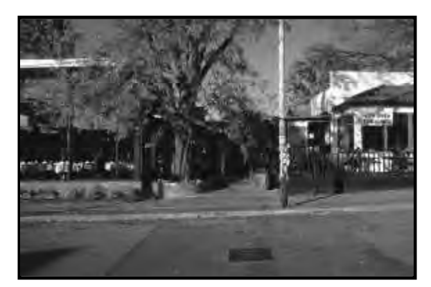
Buildings in the commercial perimeter sub-districts can utilize a wider range of materials than might be appropriate in other areas of the Village.