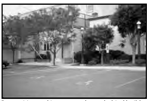
By requiring parking areas to locate behind buildings, rather than in front of them, an active and pedestrian-friendly streetscape can be maintained.