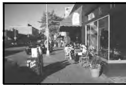
Respondents liked the outdoor seating and people on the sidewalk. This image received the highest rating among streetscapes, with 95% of respondents finding it appropriate.