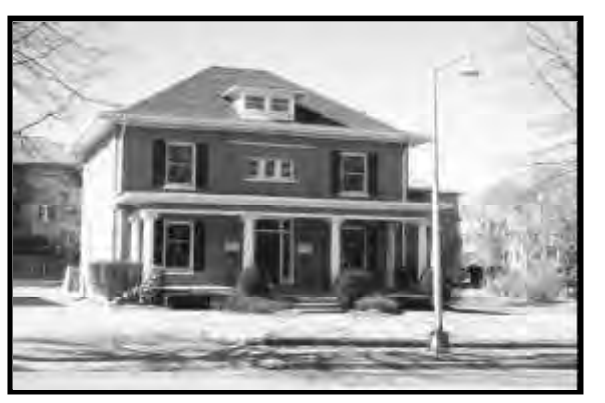
To maintain existing character, the height of new buildings in Sub-districts 1B, 2A and 2B should be capped below 3 stories.