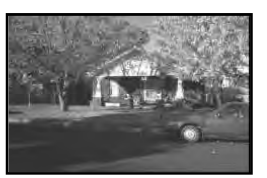
On-street parking can address parking demand in Sub-district 2B and also serve as a traffic calming device by narrowing the perceived width of driving lanes.