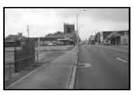
This derelict street scene results from a lack of landscaping and other pedestrian-friendly elements.

This sidewalk consists of well-maintained brick. However, the lack of other pedestrian-friendly elements resulted in a low score for this image, as 76% of survey respondents found it inappropriate.