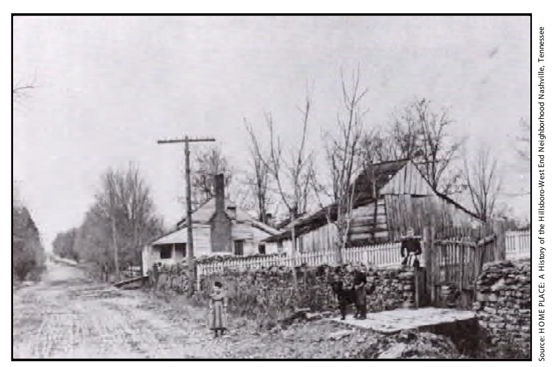
Hillsboro Road near the present day Acklen Avenue in the late 1800s.