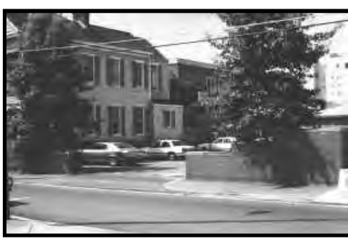
Respondents liked the combination of a low brick wall and trees to buffer this parking lot from pedestrians and mototrists, resulting in a 73% appropriate rating.