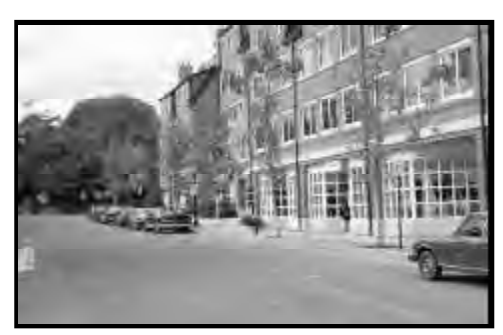
Although architecturally compatible with the Village in many ways, the 4-story scale of this building is inappropriate.