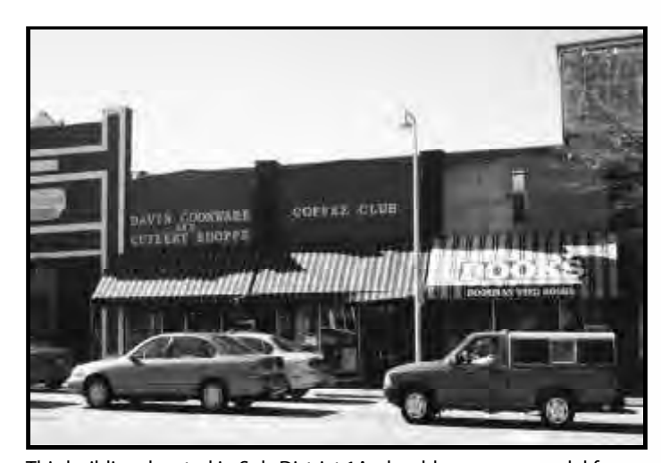
This building, located in Sub-District 1A, should serve as a model for future infill development.