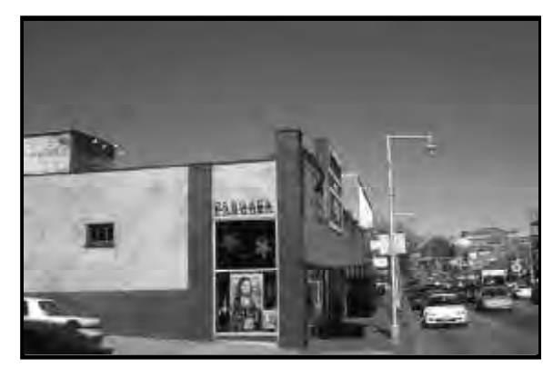
Flat roofs with parapet walls are the dominant form in the Village's commercial core.