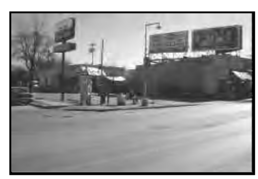
Deep highway strip building setbacks which use parking lots to detach buildings from their streets are inappropriate for older commercial areas.