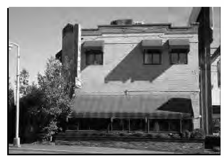
The Sportsman Grill is the only building identified as worthy of conservation in Sub-District 1C.