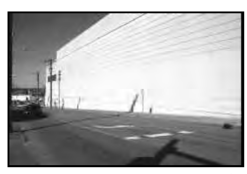
Box-like buildings having long uninterrupted facades with few window openings and recesses/ projections fail to achieve a human scale and visual relief.