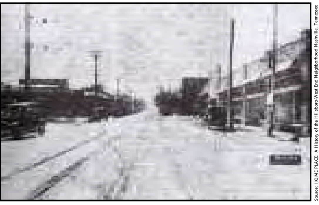
Hillsboro Village Circa 1925

"Hillsboro Village began to take shape in 1920, when two groceries and a pharmacy opened at Twenty-first and Blakemore. By 1922, two more food stores, a post office and a dry cleaners were added to the mix. Within six years nineteen businesses were operating in the village."