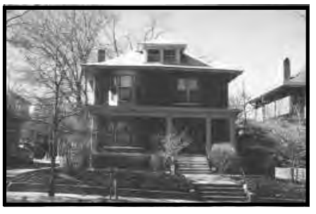
Now used primarily as offices, the residential buildings along 21st Avenue have maintained their architectural character.