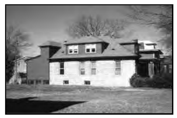
This low pitched, hipped roof with dormer windows is characteristic of American Foursquares and bungalows.