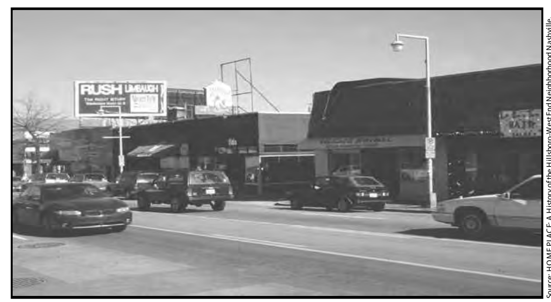
Changes between 1963 (right photo) and 1999 (above) for this section of 21 st Avenue include the removal of overhead power lines, the addition of street lights, and the addition of the mansard roof on the building on the right. The roof-top billboards and the Jones Pet Store sign remain as constants.