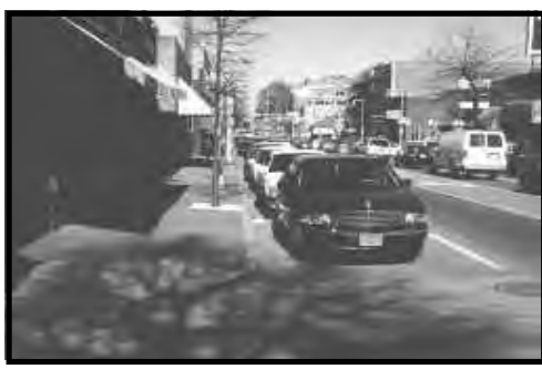
In addition to providing valuable parking spaces for businesses in the Village's commercial core, on-street parking protects pedestrians from moving traffic.