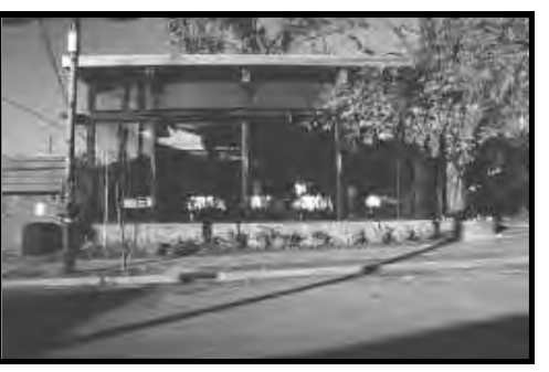
A variation in design and materials are appropriate in areas with a diversity of building styles and lack of a historic context. 73% of respondents rated this image as appropriate for the "Village".