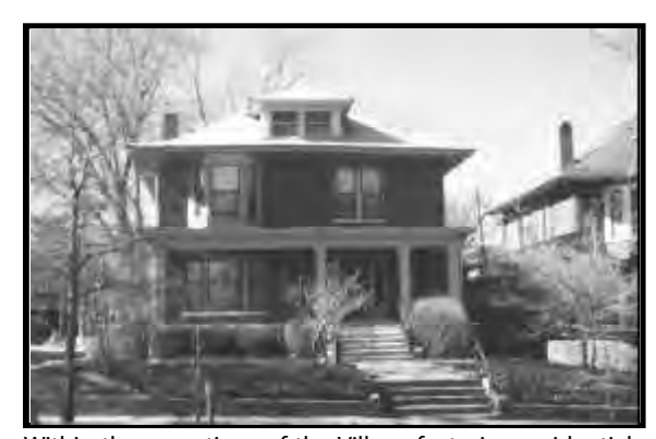
Within those portions of the Village featuring residential buildings, a maximum building width requirement will be the key massing control.