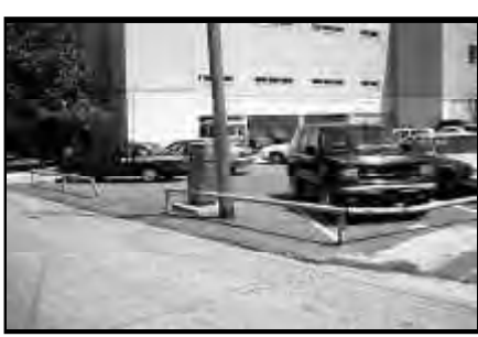
89% of survey respondents viewed this image as inappropriate. The lack of internal landscaping and peripheral screening of this parking lot creates an unattractive environment.