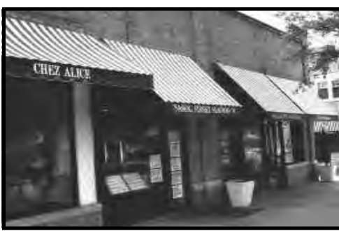
The use of awnings for signage was viewed as appropriate by 90% of survey respondents. Comments included "very good" and "love this".