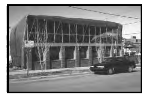
A wide variety of building types and designs characterize the commercial perimeter areas.