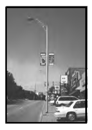
86% of respondents rated this image showing perpendicular parking as inappropriate. Comments included "no parking in front of building, prefer rear" and "no head-in".