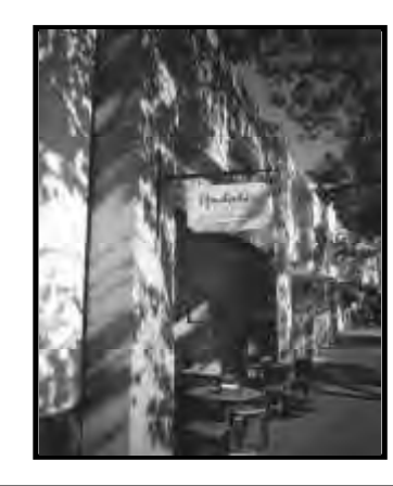
This projecting sign is creative and identifiable, yet does not compete with the building or the streetscape. It received a rating of 92% appropriate, which was the highest among signs.