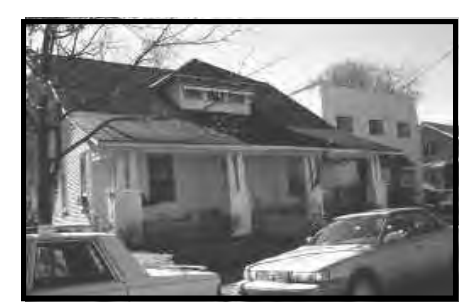
The residential buildings along the south side of Belcourt Avenue constitute a distinct and cohesive design character which contrasts with the north side of the street.