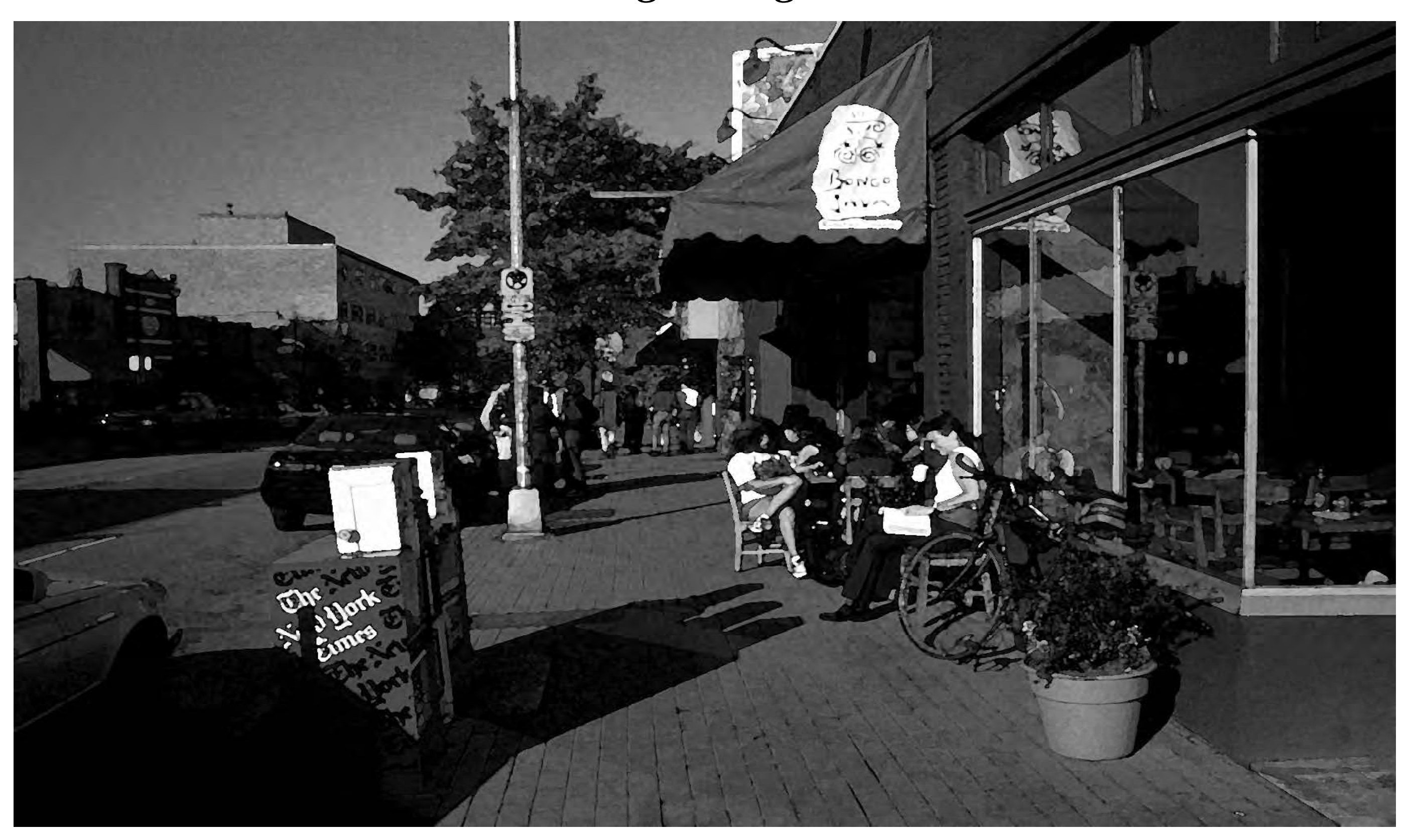
Prepared for the Nashville/Davidson County Metropolitan Planning Commission Nashville, Tennessee