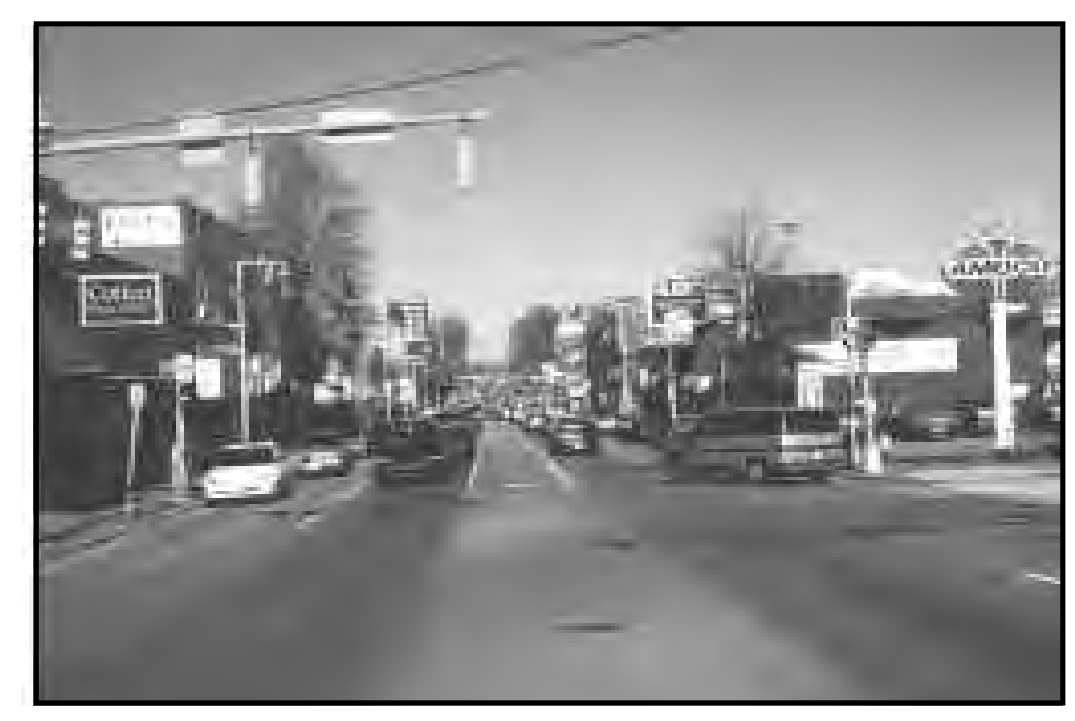
Hillsboro Village 1999