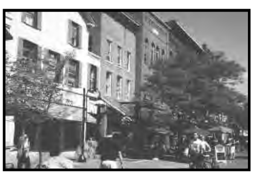
Pedestrian-scale light fixtures, street trees, awnings, and outdoor seating can help enhance and animate a commercial streetscape.