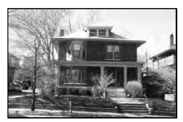
Depending upon the specific architectural style, residential structures tend to have at least 30% of their facade area comprised of window and door transparency.