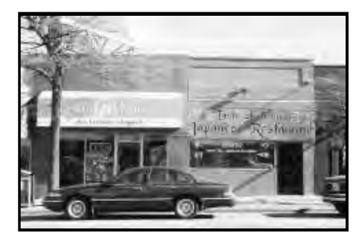
The building on the right has been altered by applying wooden panels to the base of the facade, thus obscuring the original brick.