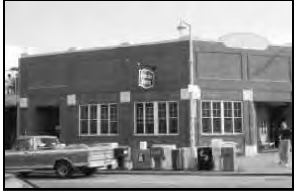
Decorative elements can be used to enhance brick, which should be the primary building material in the Village's commercial core.