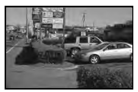
Front parking lots separate the building from the street and introduce the automobile as the prominent streetscape feature, thereby precluding the creation of a comfortable "outdoor room" along the street.