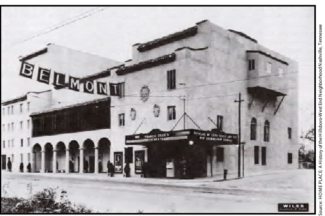
Belmont Theater soon after its opening in 1925. The site is located on the southwest corner of the 21 Avenue and Blakemore Avenue intersection where the Educators Credit Union building currently exists.