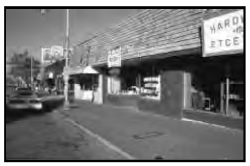
The false mansard roof in this image is too large for the building scale, inappropriate for the building's style, and obscures the building's facade.