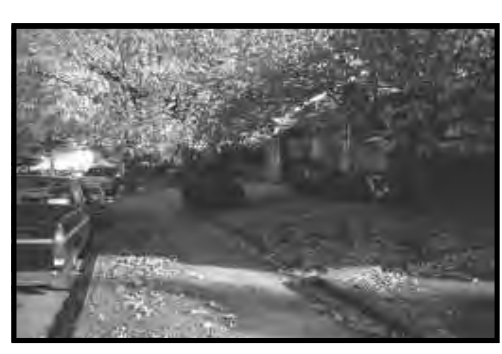
Planting strips between the curb and sidewalk provide space for shade trees and serve as further separation between pedestrians and automobiles.