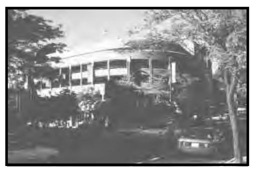
This parking structure has an architectural quality which looks more like a building, and the retail uses at the ground level help activate the streetscape.