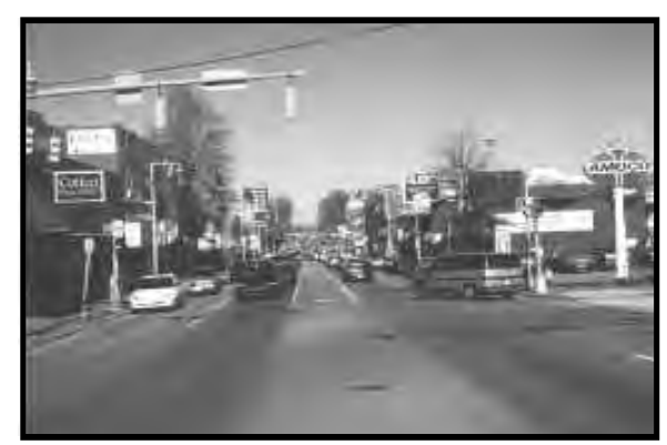
Within the commercial core of Hillsboro Village, buildings should frame the street and create an "outdoor room", which makes people feel comfortable and encourages pedestrian activity.