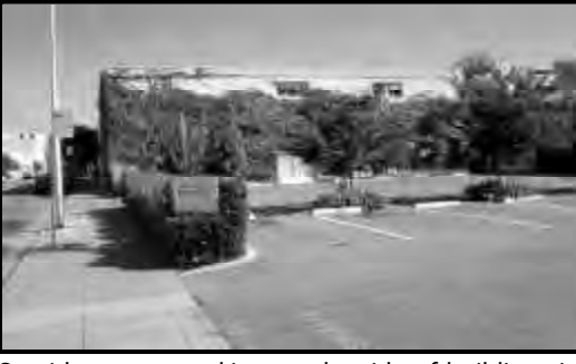
On side streets, parking on the side of buildings is acceptable, but not desirable. Landscaping, fences, and walls can help screen parking and extend the streetscape's building wall.