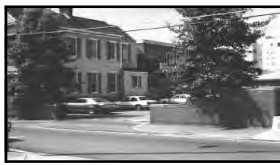
When space is limited, masonry walls can screen parking lots and accentuate the materials of adjacent buildings and sidewalks.