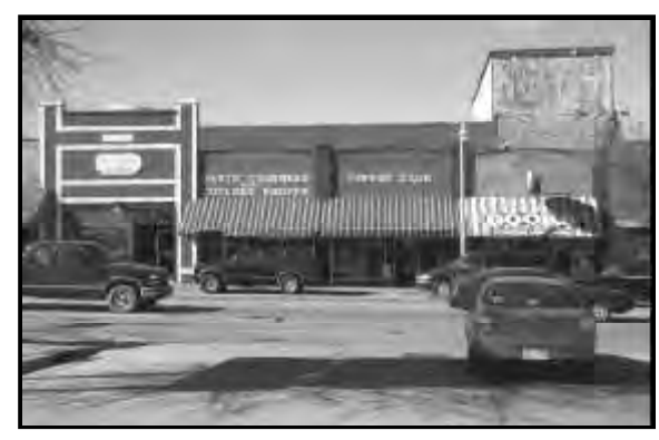
This central building has used pilasters and the shape of the parapet wall to divide a single facade into three vertically-oriented distinct bays which keep it in scale with neighboring buildings.