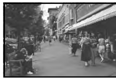
This streetscape image illustrates that inexpensive sidewalk materials such as concrete can still accommodate a pedestrian-friendly environment.