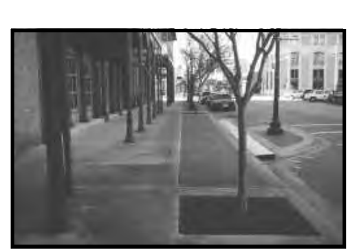
In the commercial core, tree grates, which are more space efficient than planting strips, should be used as landscaping features along sidewalks.