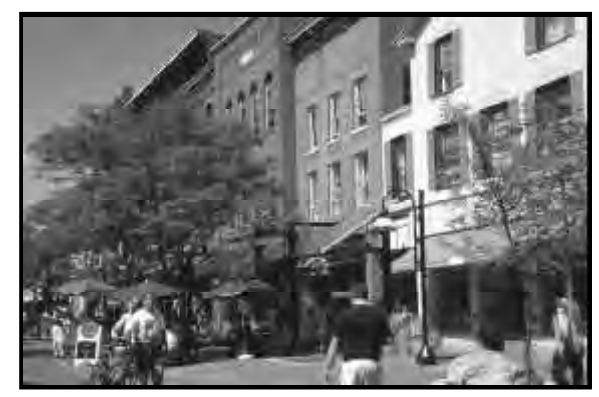
Buildings in Sub-districts 1A and 1C shall not exceed 3 stories in height.