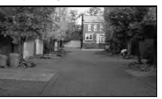
Alleys are necessary to accommodate rear parking areas. When well designed and maintained, they can be both functional and attractive.