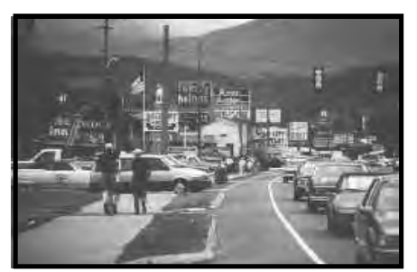
Too many curb cuts prohibit the use of onstreet parking, which provides a buffer between pedestrians and moving traffic, as well as providing an important source of needed parking.

Highway-scaled street lights, perpendicular parking in front of buildings, and frequent curb cuts create an unsafe environment for pedestrians and contributed to the low survey score (92% inappropriate) for this streetscape.