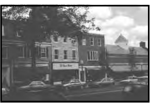
These buildings were considered appropriate by 82% of respondents. Comments included "like variety in scale and style", and "diverse but cohesive-nice".