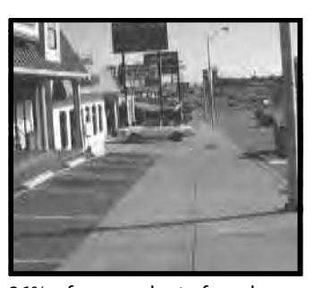
86% of respondents found perpendicular front parking inappropriate. Comments included "no parking in front of the building, prefer the rear" and "no head-in".