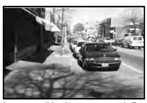
On-street, parallel parking can serve as a buffer between the pedestrian and the automobile, as well as a traffic calming measure.