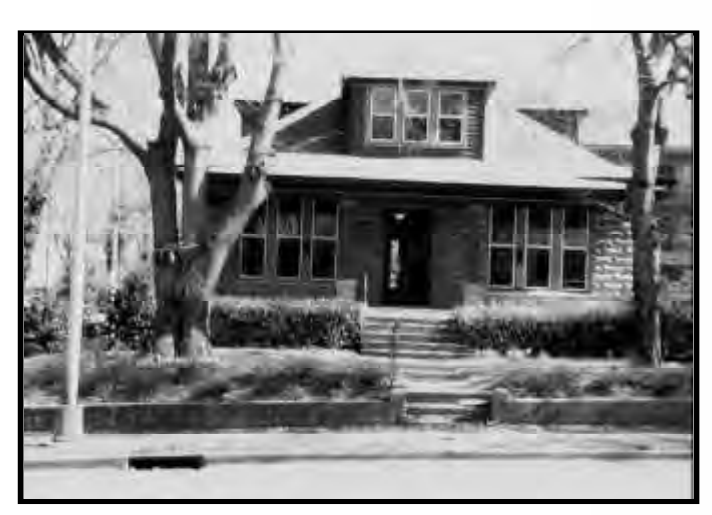
Future development in Sub-District 2A should look to this residential building for inspiration.