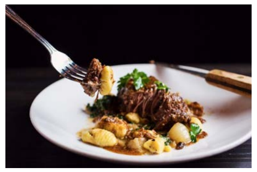
Short Rib Gnocchi