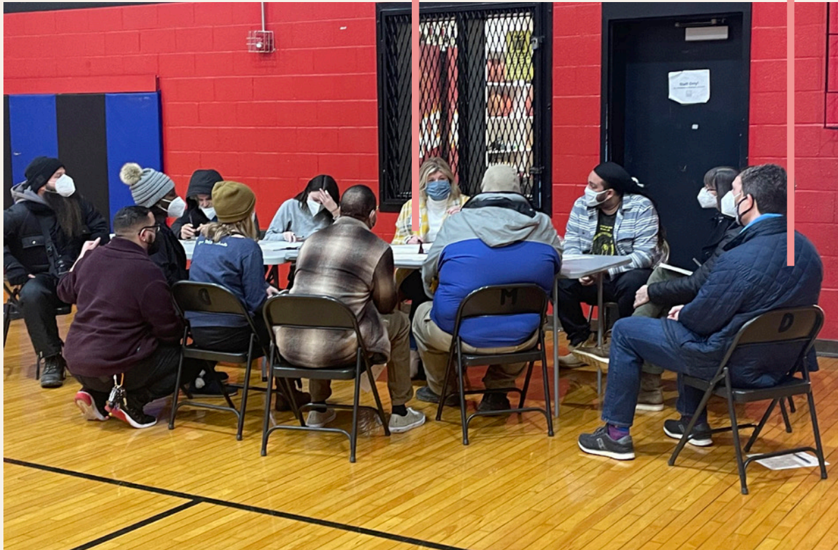
NAPIER RECREATION CENTER