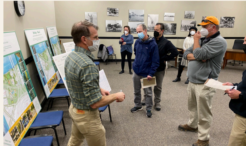
METRO PARKS STAFF