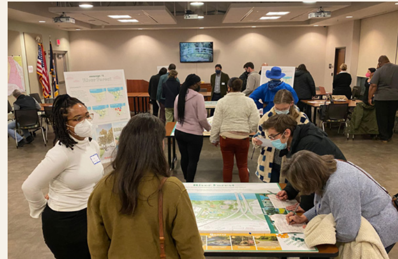
MIDTOWN HILLS POLICE PRECINCT