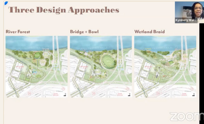
METRO PARKS FACEBOOK LIVE