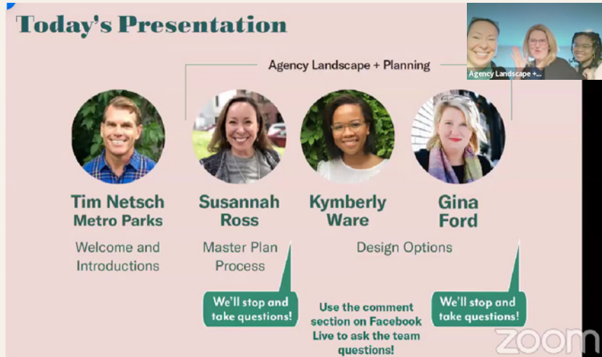
NASHVILLE CIVIC DESIGN CENTER TALK