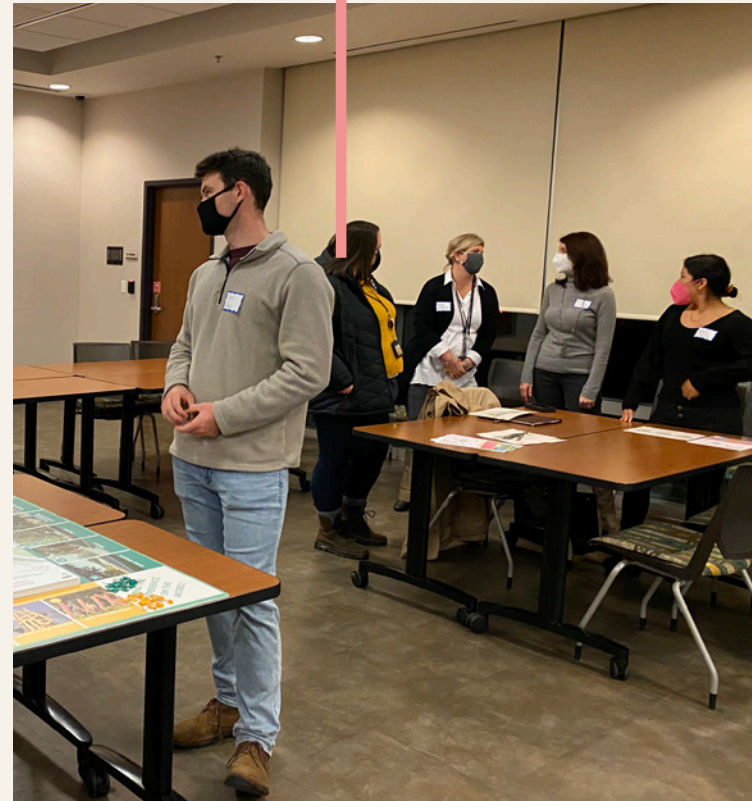
MIDTOWN HILLS POLICE PRECINCT

51% of written comments and 35% of all feedback mentioned concerns about displacement.