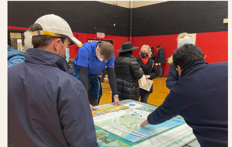
NAPIER RECREATION CENTER