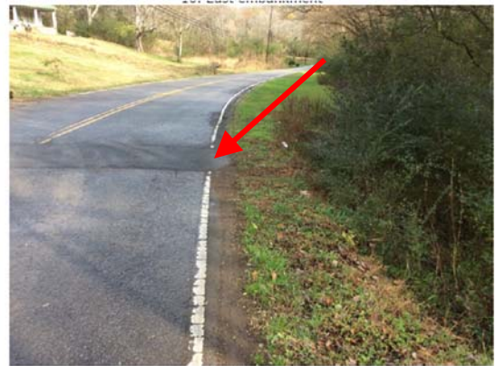
Patched Roadway Settlement