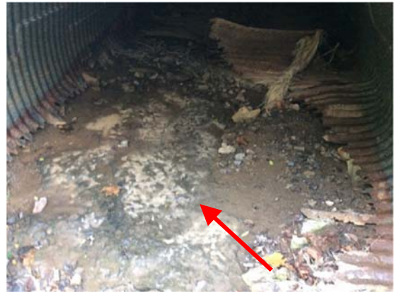
100% Section Loss throughout Invert