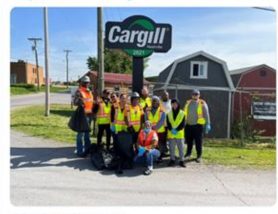
2:00 PM - May 9, 2022 - TweetDeck

@Cargill is 1 of our 79 Adopt-A-Street partners. Visit AdoptAStreet.Nashville.gov to learn more.