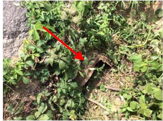
Crushed Culvert Inlet