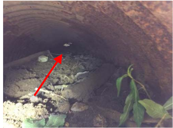
Partial Pipe Collapse w/ Heavy Corrosion