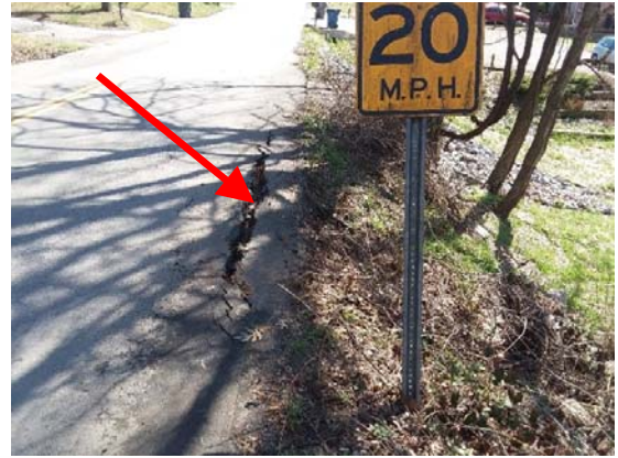
Roadway Settlement & Embankment Destabilization