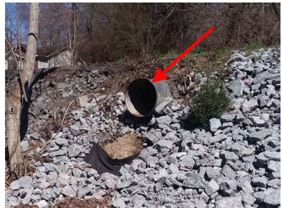
Culvert Outlet on Shear Embankment