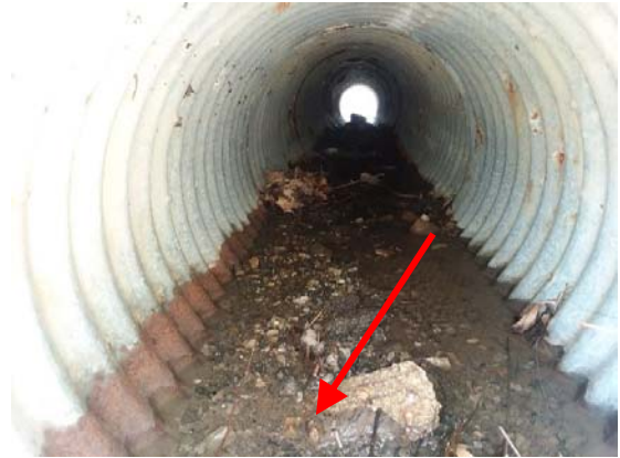
Moderate Corrosion & Sediment Buildup