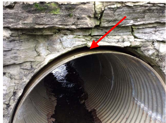
Inlet Headwall w/ Mortar Loss & Pipe Separation