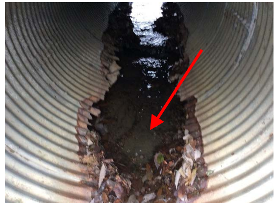
100% Section Loss