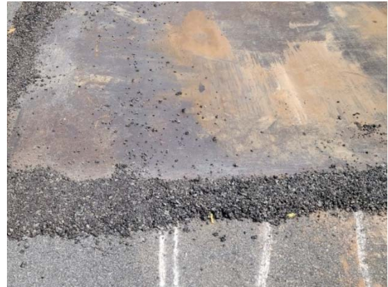
Roadway Failure w/ Steel Plate