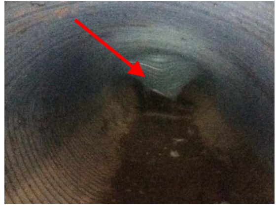
Partial Pipe Collapse