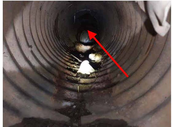
Partial Pipe Collapse