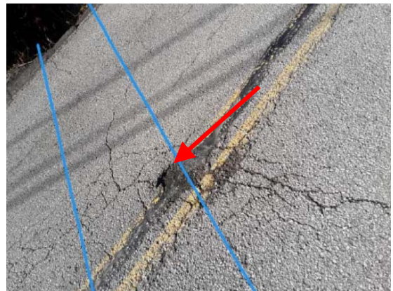
Pavement Settlement & Cracks