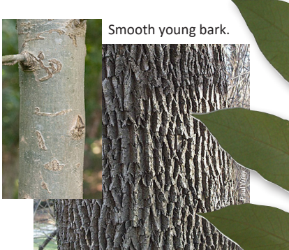
Diamond-patterned mature bark.