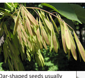
Oar-shaped seeds usually occur in clusters and hang on female trees from mid-summer until early winter.