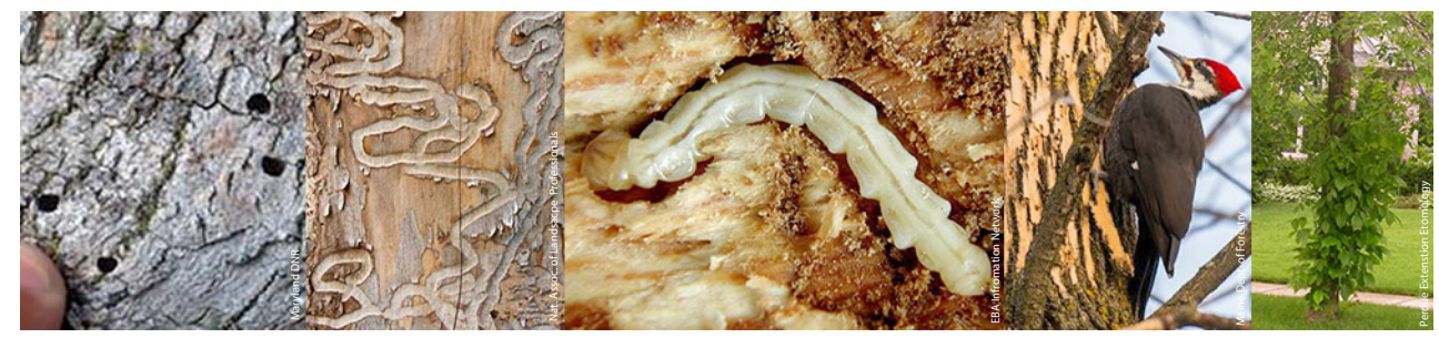
D-shaped exit holes