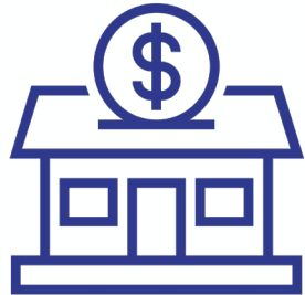
Support Nashville's Businesses