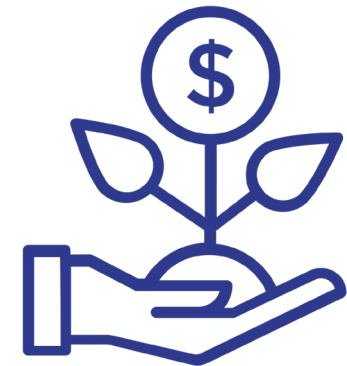
Financial Empowerment and Mobility