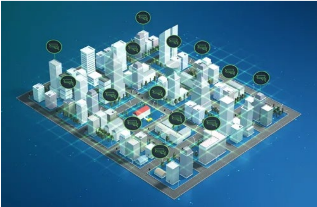
An overlay of a FUSUS network.

surveillance devices in public rights-of-way to 10 days, prohibits unlawful usages, and mandates equitable distribution of the devices. While FUSUS devices conduct surveillance in both public and private spaces, they are not specifically included in Metro Code 13.08.080, nor any other Metro code. This legislation could provide an important model for comparable FUSUS legislation. This is especially relevant as other cities' polices specifically include FUSUS LPR-integration 32 .