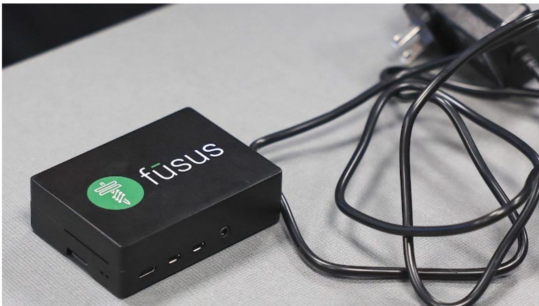
An example of a FUSUS device.

FUSUS's second level is camera integration. Camera integration gives MNPD live-stream access to integrated cameras. This allows MNPD to create a "Real-Time Crime Center in the Cloud" 10 , effectively creating a centralized database where MNPD can access cameras anywhere across Nashville in real time, regardless of if they are in the public or private sphere. Owners of the cameras can opt to give MNPD full access to their cameras, or partial access and limit the data sharing to certain times of the day or with permission. Beyond just camera access, the data from integrated cameras could potentially be linked with other MNPD technology 11 as well, including but not limited to license plate readers, body-worn cameras, and even MNPD's drones. These forms of existing surveillance technology are all compiled into one central hub for MNPD personnel to access. Alongside other police technology, this enables MNPD to view events in real time, compare data across databases, and dispatch officers to where they can view live footage.