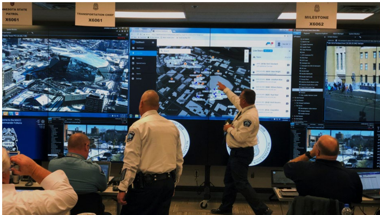
FUSUS usage in "real time."

approved for a full LPR program, there is now a large network of police surveillance cameras for FUSUS integration in Nashville.