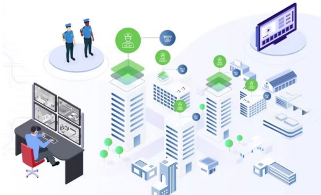
A visual representation of a FUSUS-integrated system.

included line items in Nashville’s Capital Improvement Budget for $800,000 worth of the technology in FY2023-24, indicating that the technology remains relevant to MNPDP. However, Metro Council has yet to approve the technology, which may be a prudent decision amongst concerns about its efficacy 18 . The fact that FUSUS can provide a platform that is ready to integrate ShotSpotter into might provide further motivation for MNPDP to make another push to Metro Council for its approval.