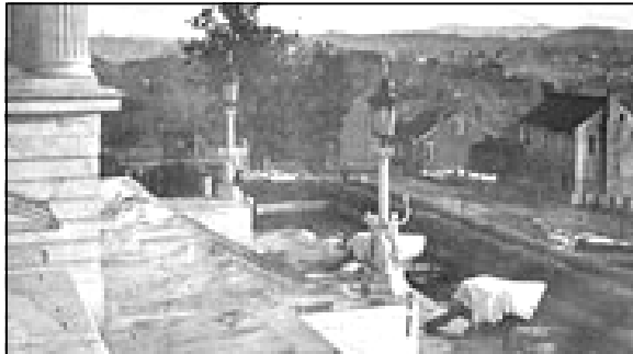
Steps of the Capitol with covered guns.

★ Nashville surrendered to the Union Army on February 25, 1862. Andrew Johnson became the nation's first military governor in March and ordered the fortification of Nashville. Union forces occupied Nashville and Fort Negley until September, 1867.