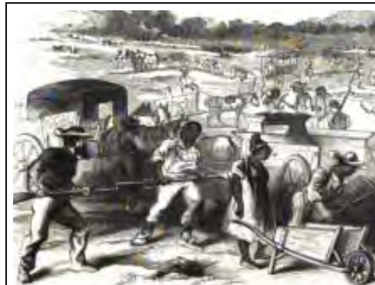
"Impressing Negroes to work on the Nashville Fortifications"

★ Conscript laborers, predominately contrabands (runaway slaves) and free blacks, built Fort Negley between August and December, 1862. The Fort was constructed from 62,500 cubic feet of stone, 18,000 cubic yards of earth, logs and railway iron.