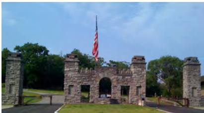
Entry Gates Constructed by the WPA

In 1936, 800 men working for the WPA (Works Progress Administration) reconstructed Fort Negley at a cost of $84,000. The Fort reopened to the public in 1938. In the late 1940s, the city removed the deteriorated stockade and the Fort closed to the public.