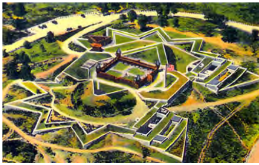
1930s Postcard Illustrating the WPA's Reconstruction of Fort Negley.

★ The City of Nashville purchased the property in 1928.