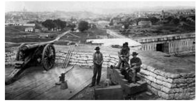
Fort Negley, 1864

★ The 12th Indiana Light Artillery operated and maintained Fort Negley's 11 guns throughout the Civil War.