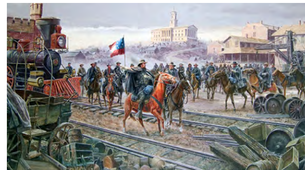
Order Out of Chaos: Nathan Bedford Forrest, Nashville, Tenn., February 22, 1862 Mort Kunstler, 2007