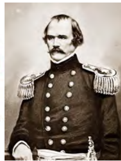
Gen. Albert S. Johnston

On the morning of February 17, city authorities closed the post office, businesses and newspapers.