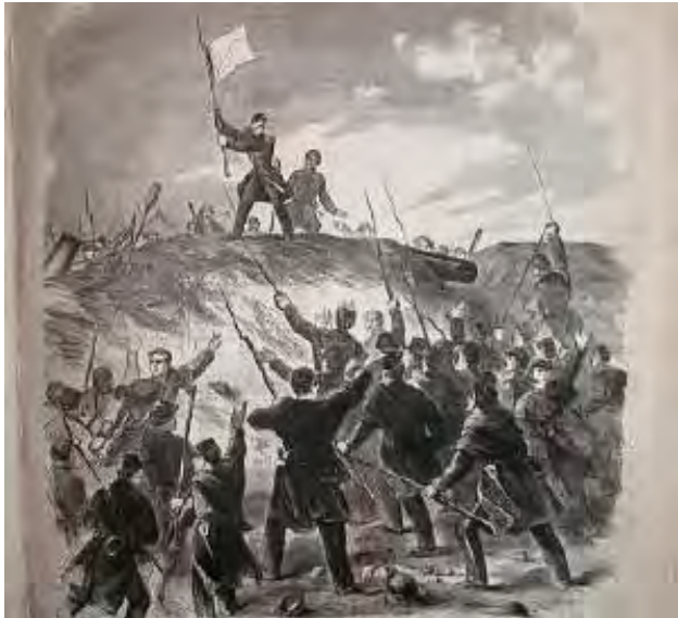
"The Surrender of Fort Denelson [sic] February 16, 1862" Harper's Weekly March 1, 1862

Pastors dismissed their congregations and panic broke out in the streets of Nashville as citizens questioned an uncertain future.