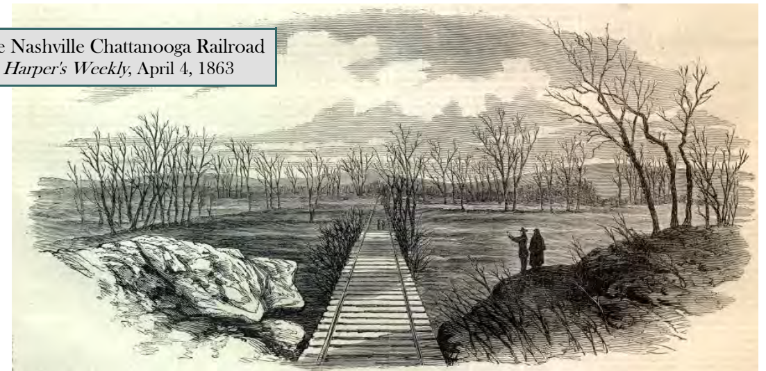
The Nashville Chattanooga Railroad Harper's Weekly , April 4, 1863

For nearly two weeks, the citizens of Nashville awaited the Union Army. On February 25, the city became the first captured Confederate capital and the Union’s most prized occupied city.