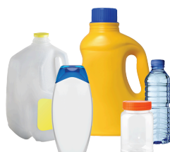
Plastic Bottles, Jars & Jugs