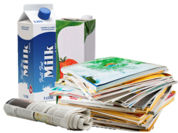
Paper & Cartons

If you're part of our curbside recycling program, you can place mixed recyclables in your green recycling cart. Please note that glass is NOT currently accepted in curbside recycling.