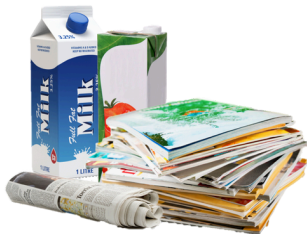
Paper & Cartons