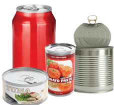
Food & Drink Cans